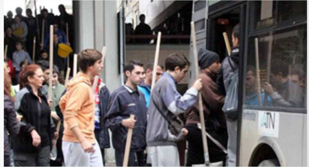
The Angels of the Mud at work